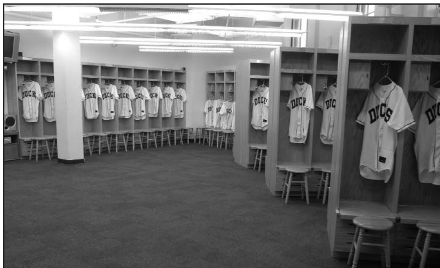
Varsity Locker Room