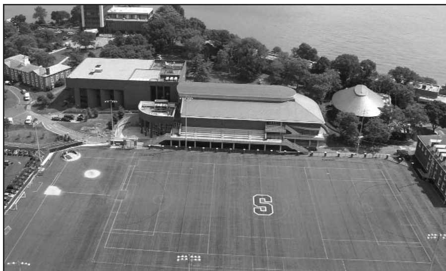
Dobbelaar Baseball Field

Stevens is one of few Division III institutions in the nation to establish a private strength and conditioning training facility (4,000 square foot) for exclusive use by its varsity athletes. Year-round strength and conditioning programs for each sport are devised through consultations between the sport's head coach and two full-time strength and conditioning coaches.