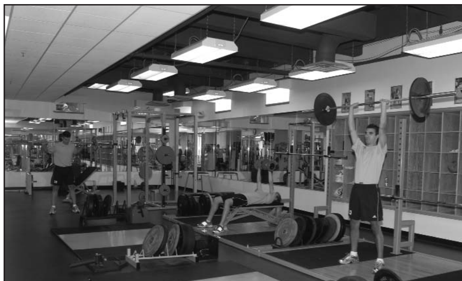
Strength & Conditioning