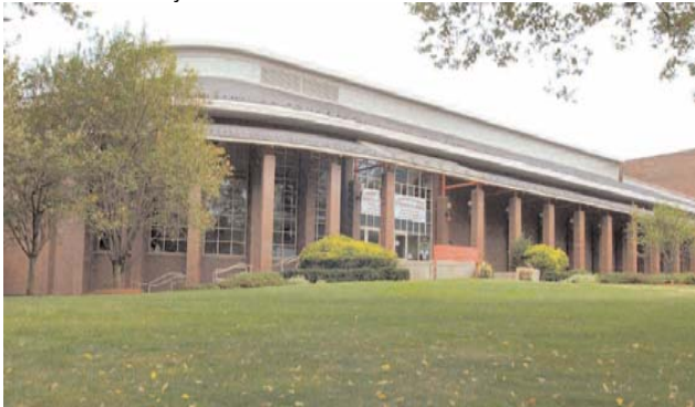
Charles V. Schaefer Athletic and Recreation Center