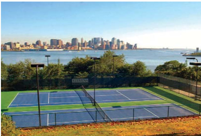
Two of Six Newly – Refinished Tennis Courts at Stevens