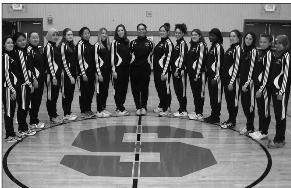
2007-08 Stevens Institute of Technology Women's Fencing Team