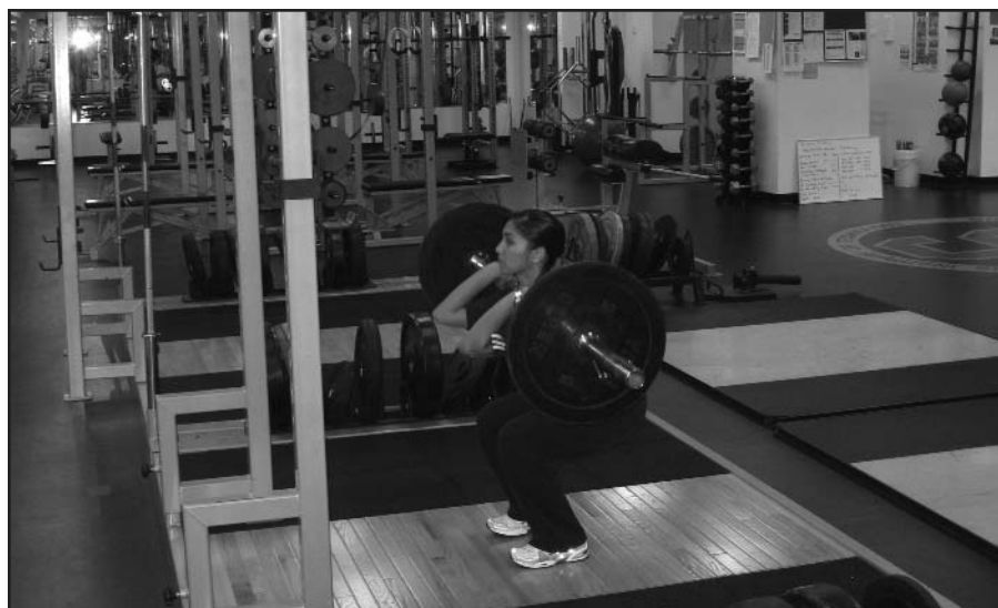
Strength & Conditioning