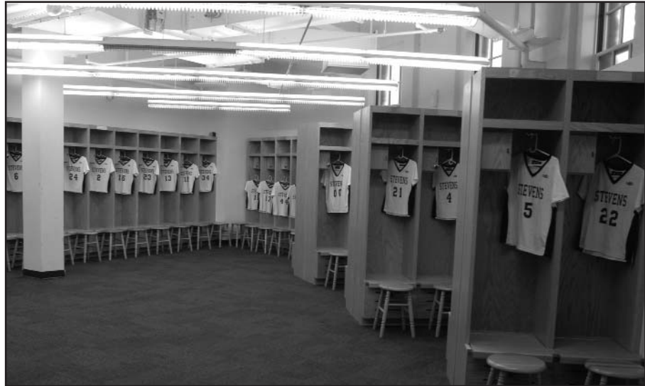
Varsity Locker Room

Stevens is one of few Division III institutions in the nation to establish a private strength and conditioning training facility (4,000 square foot) for exclusive use by its varsity athletes. Year-round strength and conditioning programs for each sport are devised through consultations between the sport's head coach and two full-time strength and conditioning coaches.