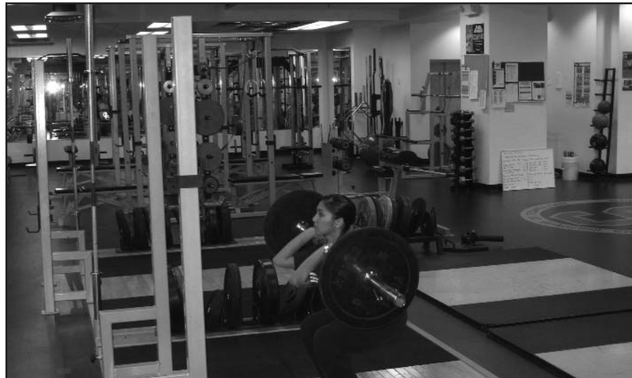
Strength & Conditioning