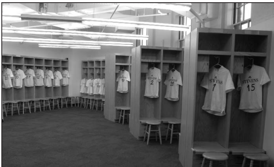
Varsity Locker Room

Stevens is one of few Division III institutions in the nation to establish a private strength and conditioning training facility (4,000 square foot) for exclusive use by its varsity athletes. Year-round strength and conditioning programs for each sport are devised through consultations between the sport's head coach and two full-time strength and conditioning coaches.