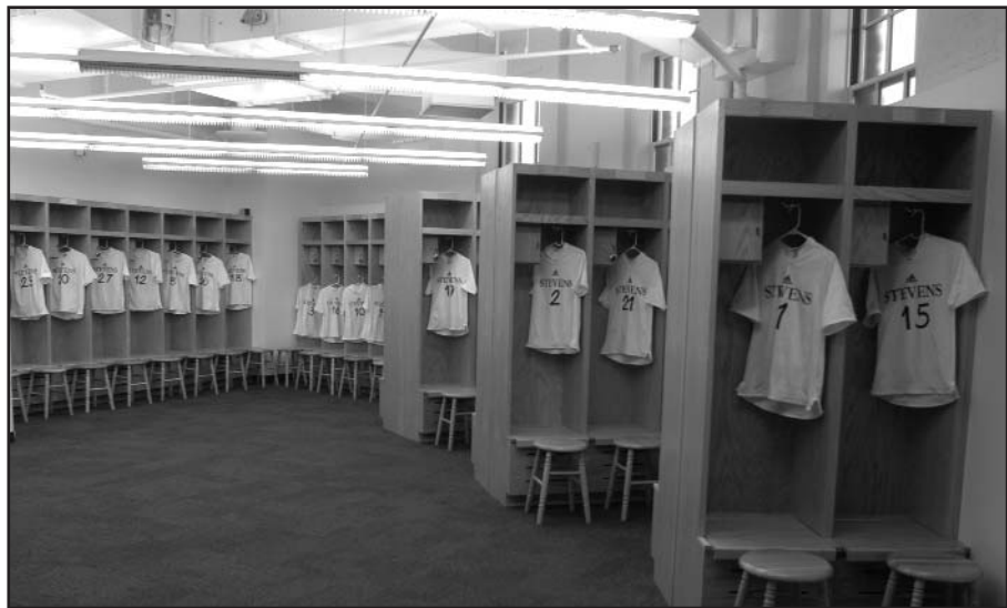
Varsity Locker Room

Stevens is one of few Division III institutions in the nation to establish a private strength and conditioning training facility (4,000 square foot) for exclusive use by its varsity athletes. Year-round strength and conditioning programs for each sport are devised through consultations between the sport's head coach and two full-time strength and conditioning coaches.