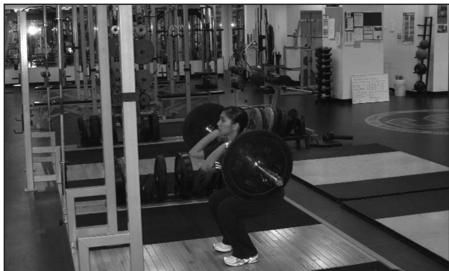
Strength & Conditioning