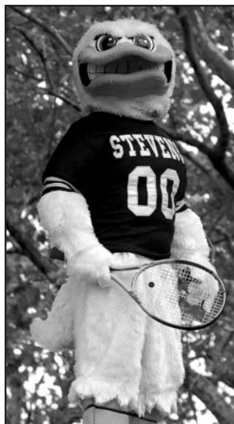
Attila the Duck